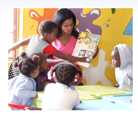
This is where it all starts – building language and supporting learning from birth to five years.