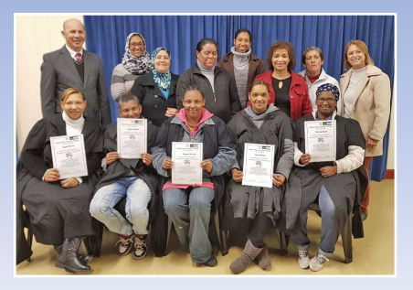
Celebrating families and their role in supporting learning at home.

We are starting to see how organisations working in the birth to five space are investing in building language and early literacy messaging into their work with parents and practitioners. We have seen a growing demand for our school-based programme for parents and seen how transformative this programme is for schools and teachers who are realising the potential of working together with families in the communities they serve.