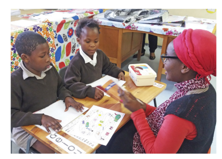
Volunteer tutors give the gift of reading.

As an organisation, we are meeting and exceeding our reach targets. Perhaps as importantly, as we grow, we have been developing internal systems that increase our efficiency and use of resources. We have also invested in support functions within the organisation in the areas of data management, publishing and production, communication and stock management. This means our content and training teams can focus on what they do best. We now have the challenge of mobilising funding that can sustain a bigger team year on year. There is no doubt that there are moments when we feel overwhelmed by the challenges we face as an NGO, and the enormity of the challenge we as South Africans face to improve educational outcomes for all of our children. We can't afford to fail in this task and will continue to do everything we can to make sure that a new generation of children has the early learning opportunities it so richly deserves. Shelley O'Carroll