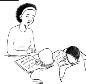
Writing and drawing (15–20 minutes)