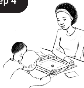
Games to teach letter-sound and word knowledge (15–20 minutes)