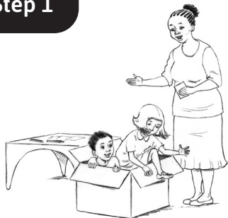
Talking and doing (5–10 minutes)