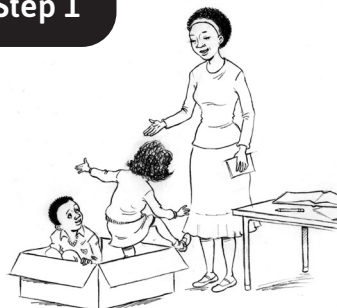
Talking and doing (5–10 minutes)