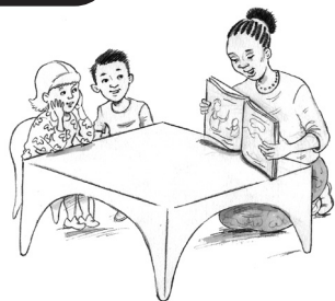
Reading (10 minutes)