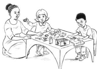
Games to build listening skills and letter knowledge (10 minutes)