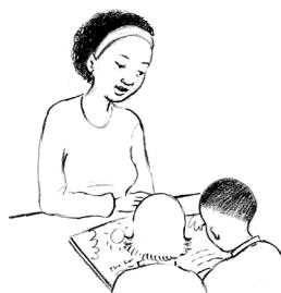
Reading (5–10 minutes)