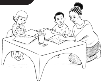
Writing and drawing (10–15 minutes)