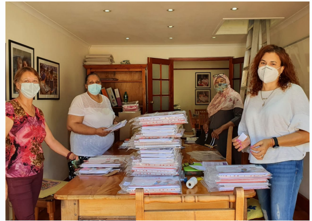
Hard copy HSP materials went to all our on-line trainees.

Supporting informal learning at home in the early years