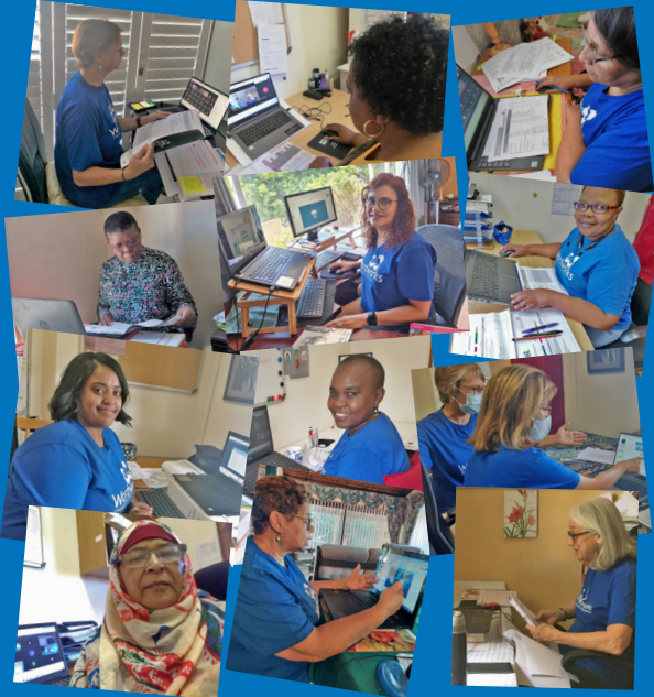
Wordworks team members conducting on-line training.

Term One always means Training of Trainers at Wordworks, and this year our team rose to the challenge of online learning, with 494 people attending courses to equip themselves to run Wordworks programmes in their contexts.