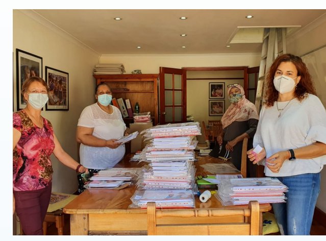
Hard copy HSP materials went to all our on-line trainees.