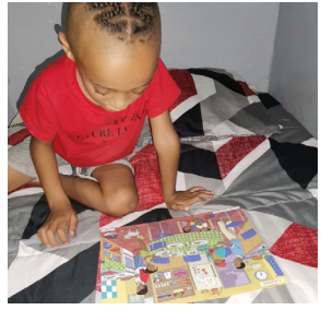
It is not too late to join our bulk print run for Term Three. Go to https://forms.gle/ t8xUicCA12zkfaDa8 to sign up for your school or organisation.

Wordworks remains in touch, even while social distancing! We are sharing practical early literacy tips for families in different languages on our website: https://wwhomeliteracy.org.za/