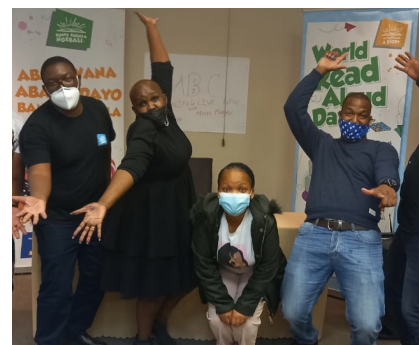
Training of Story Sparkers as part of the Yizani Sifunde Project.