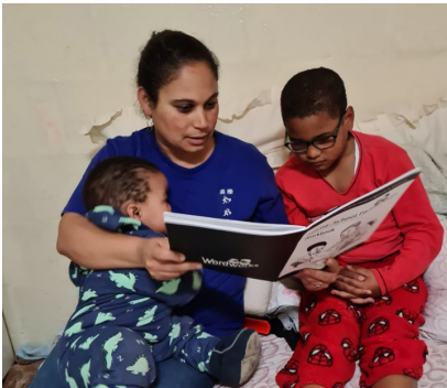
Mom and son from Willows Primary School look at HSP parent workbook.

Supporting informal learning at home in the early years