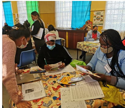
Parent session at Belmor Primary School .