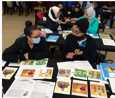
Training of Grassy Park ECD Forum Practitioners.