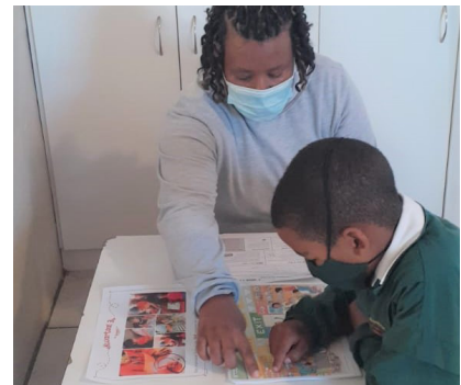
Darling Outreach after school programme – reading the Big Picture story.