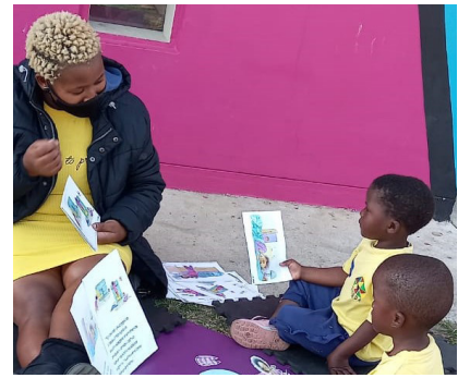
Thanda ECD Centre – Working with little ones on the Little Stars programme.

Yizani Sifunde (isiXhosa for “Come let’s read”) is a partnership project with Nal’ibali, Book Dash and Wordworks. It aims to address literacy challenges in parts of the Eastern Cape by working with young children, families, and educators. Khululeka and ITEC are implementing partners.