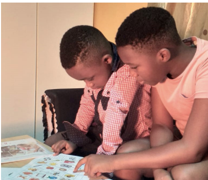
Alphabet game – brother helping little brother learn his letter-sounds.

Home learning programme for Grade R and Grade 1