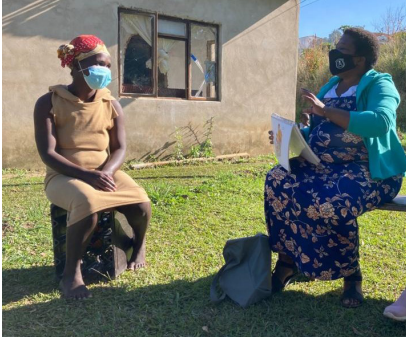
Siyakwazi – sharing EWC programme materials with a young mom.