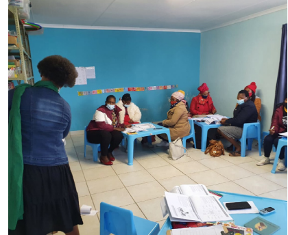
EWC parent workshops run by the Liyita Foundation , Madwaleni District.