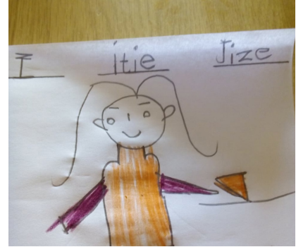
The Lebone Centre – an example of a child's invented spelling: "I eat cheese".