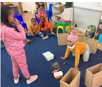
Khululeka – little ones acting out ‘Pendo the cow’ story.

Yizani Sifunde (isiXhosa for “Come let’s read”) is a partnership project with Nal’ibali, Book Dash and Wordworks. It aims to address literacy challenges in parts of the Eastern Cape by working with young children, families, and educators. Khululeka and ITEC are implementing partners.