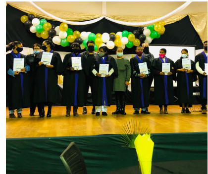
Parent certification at Simondium Primary School .