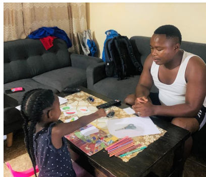
Dad enjoying TIME activities with daughter.