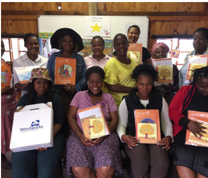
Training of Communities, Children & Responsible Care Practitioners.