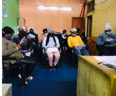
Pauline Podbrey Foundation working with parents on the EWC Programme.