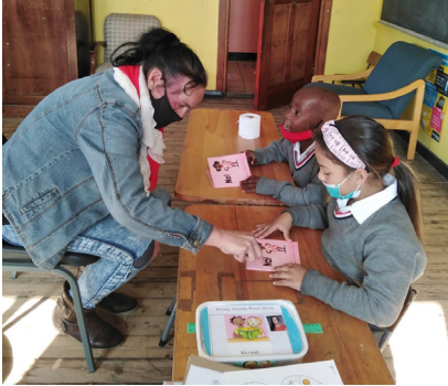
St. Agnes Primary School – reading one of the Book Dash books together.

Supporting children learning to read and write