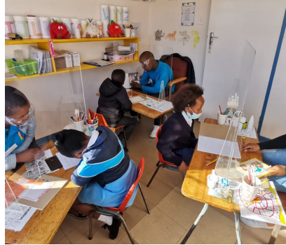
Ummangaliso Primary School session with tutors.