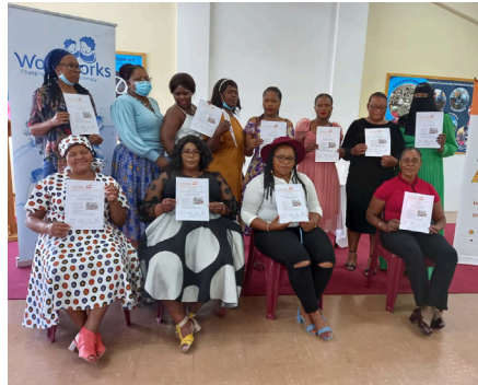
Little Stars ECD Practitioner Certification Ceremony in the Eastern Cape