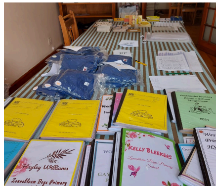
HSP Portfolios of Evidence - proof of Teacher-Facilitators' hard work