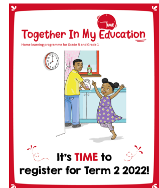
40 000 home learning activity packs ordered for Term 1 – Term 2 orders open. Schools working in partnership with parents and caregivers to make up learning losses.