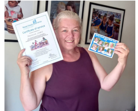
Certificates of service for longstanding Ready Steady tutors and coordinators