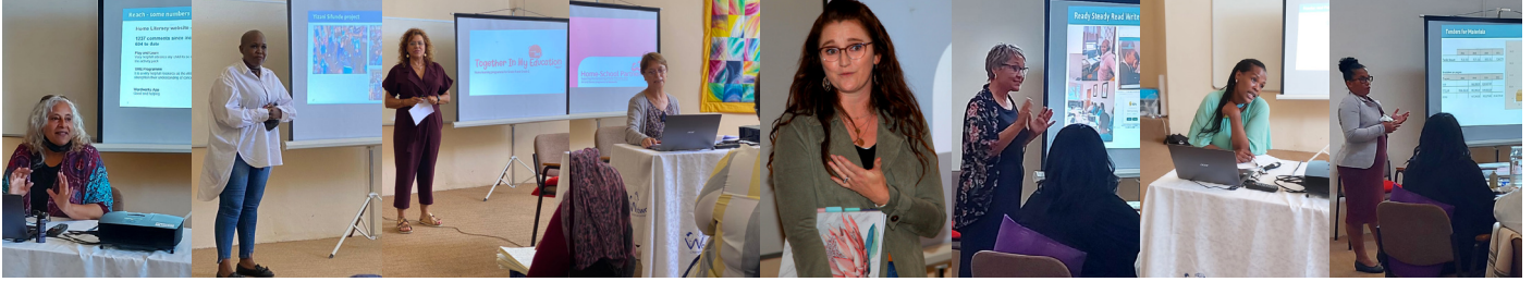
Team members report on Wordworks activities for the year