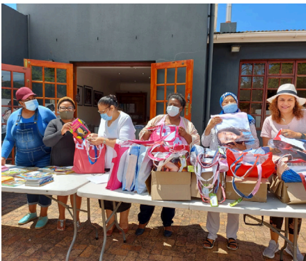
Undefeated by Covid Wordworks staff pack gifts for graduates