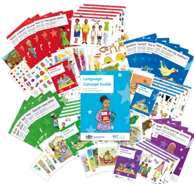
Gauteng Grade R Language Improvement Programme materials ready for teacher training in 2022