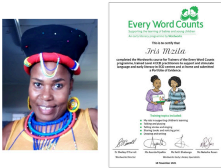
One of 24 certificates handed to NGO Trainers now qualified to train on the EWC and Little Stars programmes