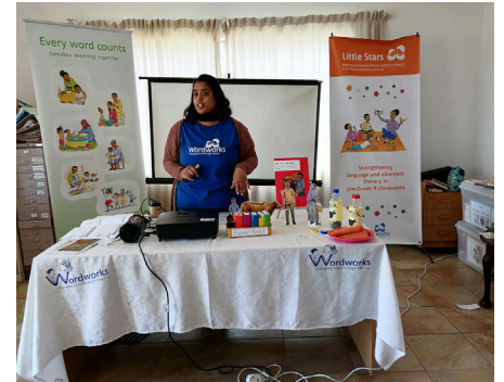
Little Stars orientation for 2022 pilots with Districts and ECD Forums