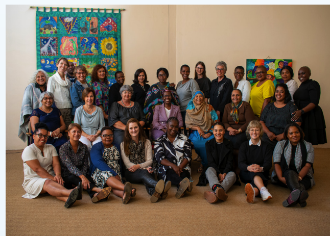
The Wordworks Team

Wordworks remains in touch, even while social distancing!